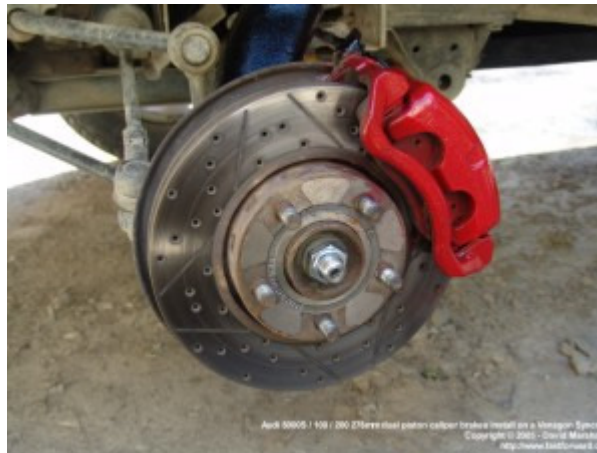
Audi 5000S / 100 / 200 brakes mounted on a Vanagon Syncro

Once the calipers and brake lines are in place, bleeding the system is necessary and then you're set! Well, almost, you'll need 15" or larger wheels to fit over the larger brakes. There are some wheels on the market that don't fit the South African brakes, I have not tested these wheels with the Audi brakes so do your wheel shopping carefully. I test fitted the 15" and 16" wheels that I sell at http://www.fastforward.ca and they all fit perfectly!